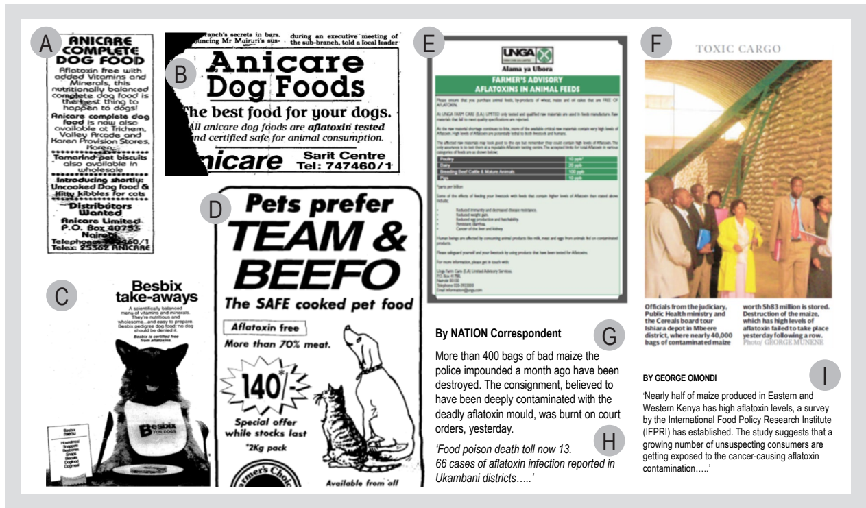
Figure 1. Examples of mentions of aflatoxins in print media: (A) 1985; (B) 1989; (C) 1993; (D) 1998; (E) 2008; (F) 2009; (G) 2004; (H) 2005; and (I) 2011. Early mentions in print media were related to pet food and animal feed.

peer-reviewed literature discussed previously and through media reports (Figure 1F, G, H, and I; Table 3). Table 3 lists media mentions and their thrust that depict an increase in reporting about aflatoxins over the years. Albeit regular aflatoxins contamination mentions in produce from Eastern and Nairobi provinces, the spread of reporting in other regions allude to a nationwide problem (Figure 2) rather than regional, and across various food commodities (Figure 3).